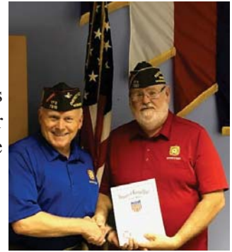
District Ten Commander presenting awards to Post 7327.