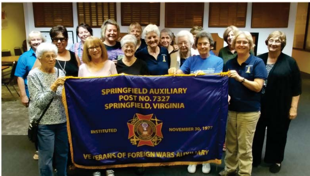
Auxiliary Members with the new banner, October 2017.